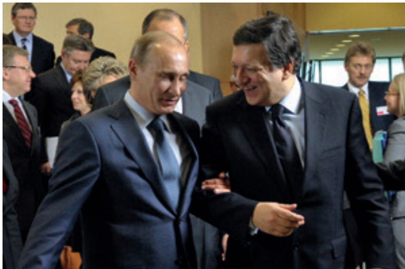
but not always ...