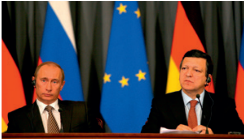
Relations with Russia's Vladimir Putin were often tense ...