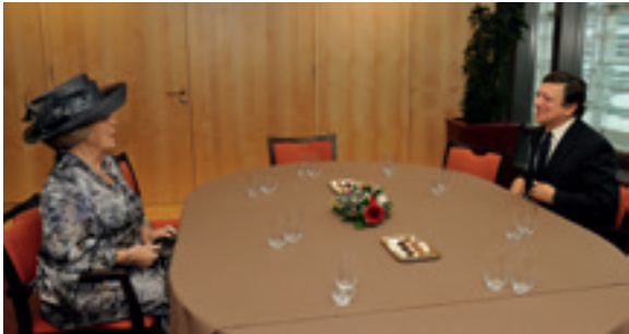
[CLOCKWISE FROM TOP LEFT] King Philippe visiting the European Commission while he still was Crown Prince of Belgium, and with King Albert II at the occasion of the 2000th weekly meeting of the College of Commissioners. Welcoming Prince Felipe of Spain (now King Felipe VI) to the European Commission in 2008. Receiving Queen Beatrix of the Netherlands in the European Commission in 2010. With the former King of Spain Juan Carlos I — a true friend.