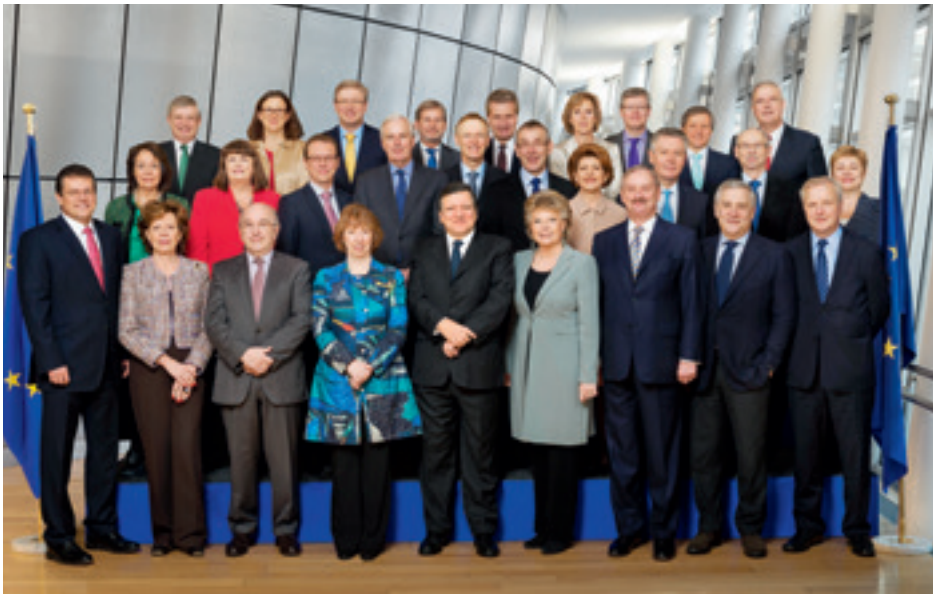
The value of teamwork: my first and second Commission.