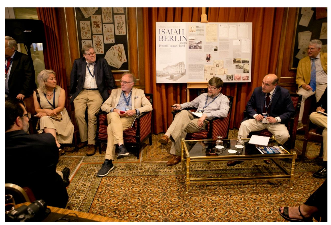
June 26, After Dinner Conversation on Isaiah Berlin and the Estoril Palace Hotel