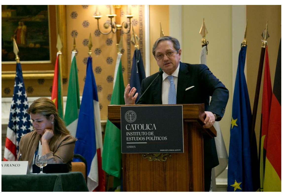
June 27, The International Security Landscape: NATO'S Response HE Luís de Almeida Sampaio , Ambassador of Portugal, NATO, Brussels