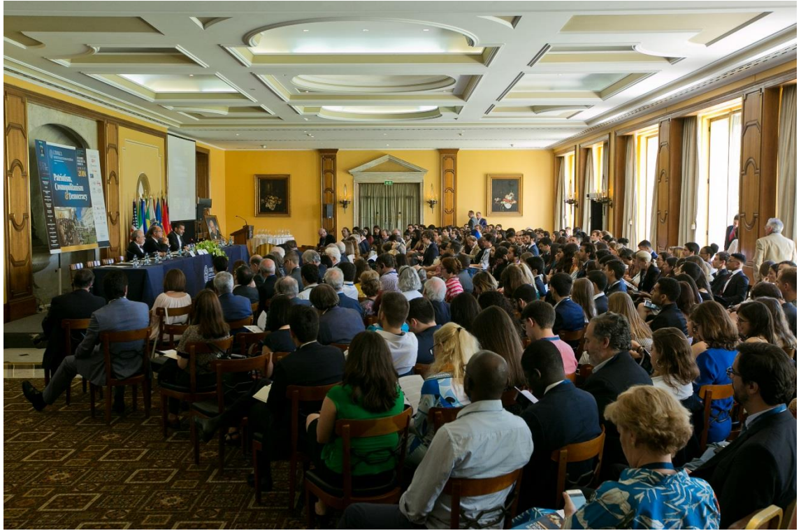
Estoril Political Forum 2018 — Opening Session